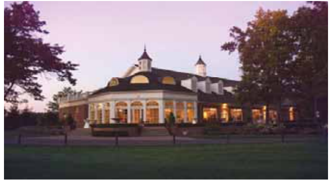
Off of 24 Mile Road Just East of Old Van Dyke

The natural beauty of a gentle rolling terrain, variety of oak, ash and cherry trees combined with 18 magnificent holes of championship golf makes Cherry Creek a truly unique golfing experience & dining